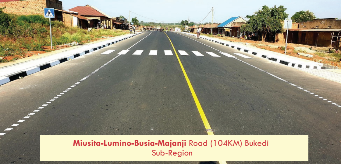
Miusita-Lumino-Busia-Majanji Road (104KM) Bukedi Sub-Region