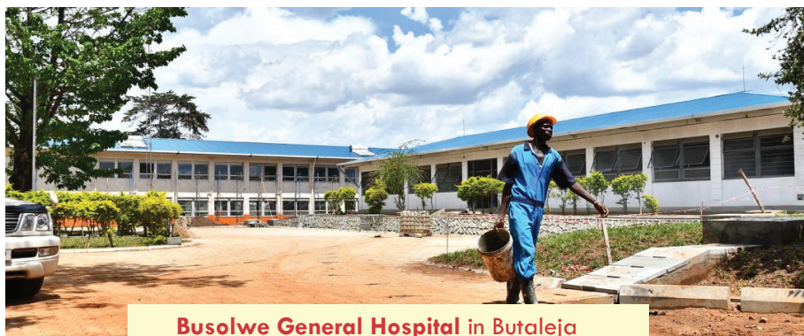
Busolwe General Hospital in Butaleja District, Bukedi Sub-Region