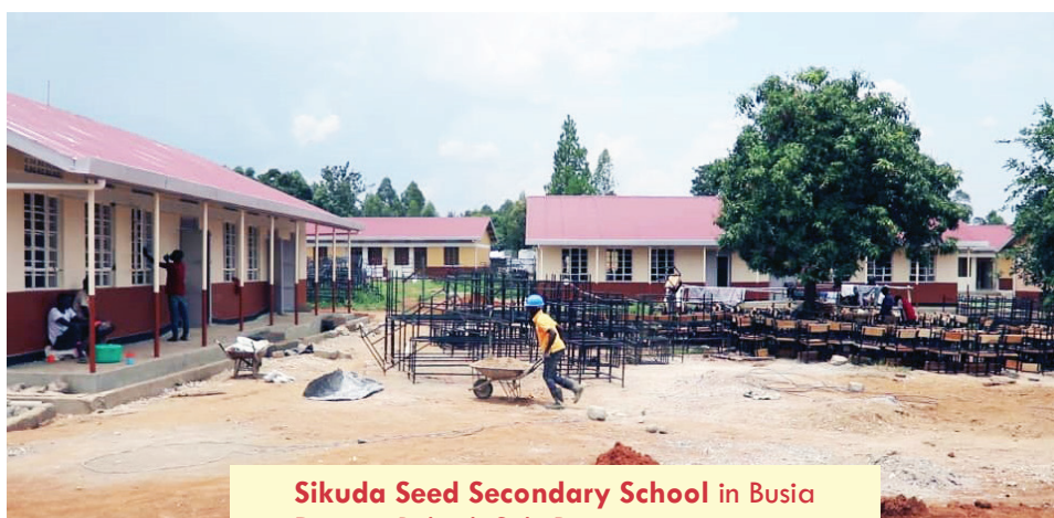
Sikuda Seed Secondary School in Busia District, Bukedi Sub-Region