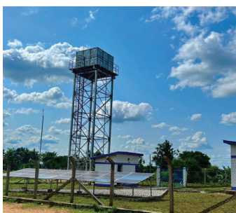
Budumba Solar powered piped water scheme in Butaleja District, Bukedi Sub-Region